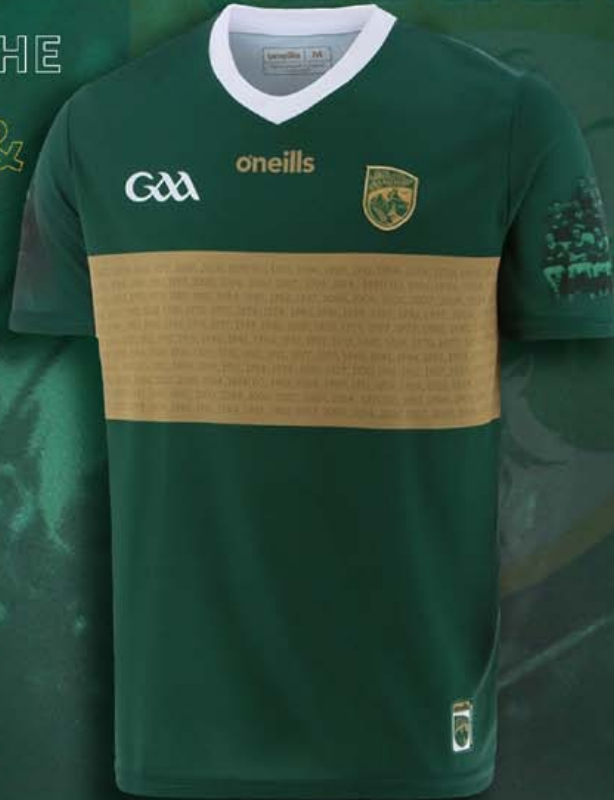
Kerry Commemorative Jersey